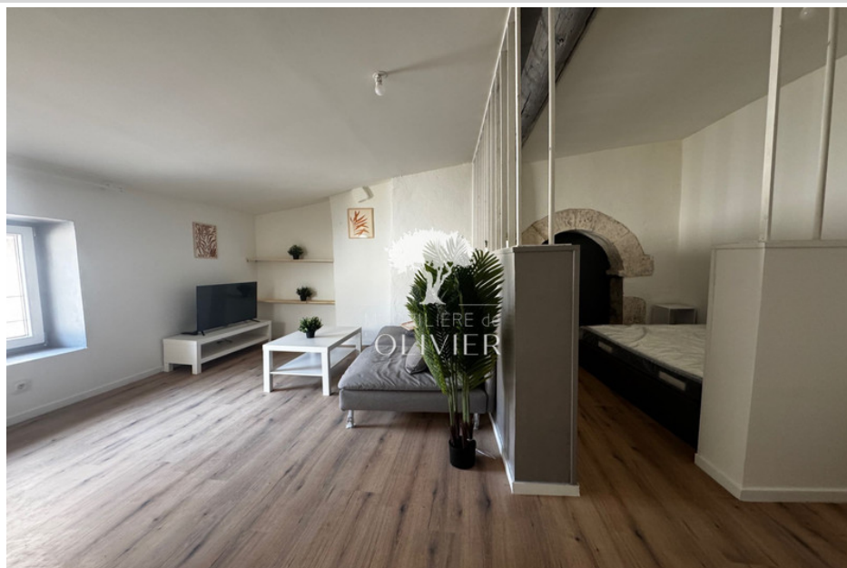
Apartment 12-22-0227 Apt

Luberon, Apt. Ideally located in the heart of the city center. Charming studio located on the 3rd and last floor. This accommodation includes: a fitted and equipped kitchen opening onto the living room, a partition allowing the separation of the bedroom area from the living room area, a bathroom with WC. completely renovated and tastefully decorated. Available on 03/11/2025