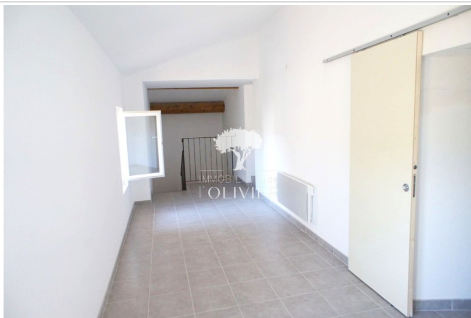
Apartment 1878 Apt

Luberon Apt, in a building completely restored in the first floor, new T2 52m2 consisting of: 1 lounge, 1 kitchen with balcony, 1 bathroom with wc, 1 terrace. Add to 01.09.2013.