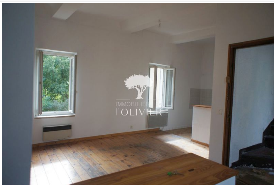
Apartment 1538 Apt

Luberon, apt, close to the town center, t2 apartment of 45m2, on the ground floor, general condition good, with 1 living room / kitchen, 1 bathroom with toilet, 1 bedroom with storage. electric heating, unfurnished rentals, duration 36 [months], available on 01/06/2015 om retail costs.